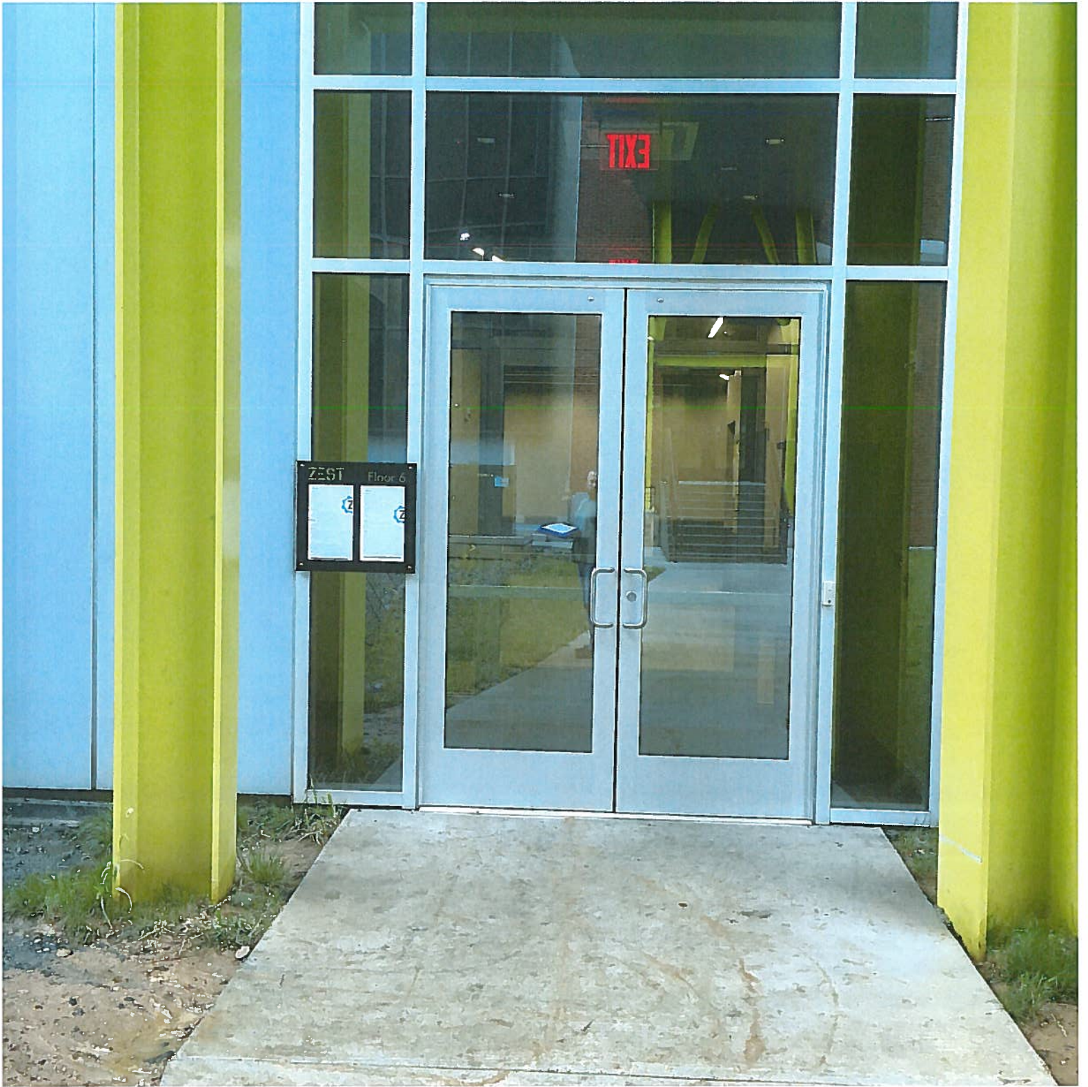
South entrance under bridge