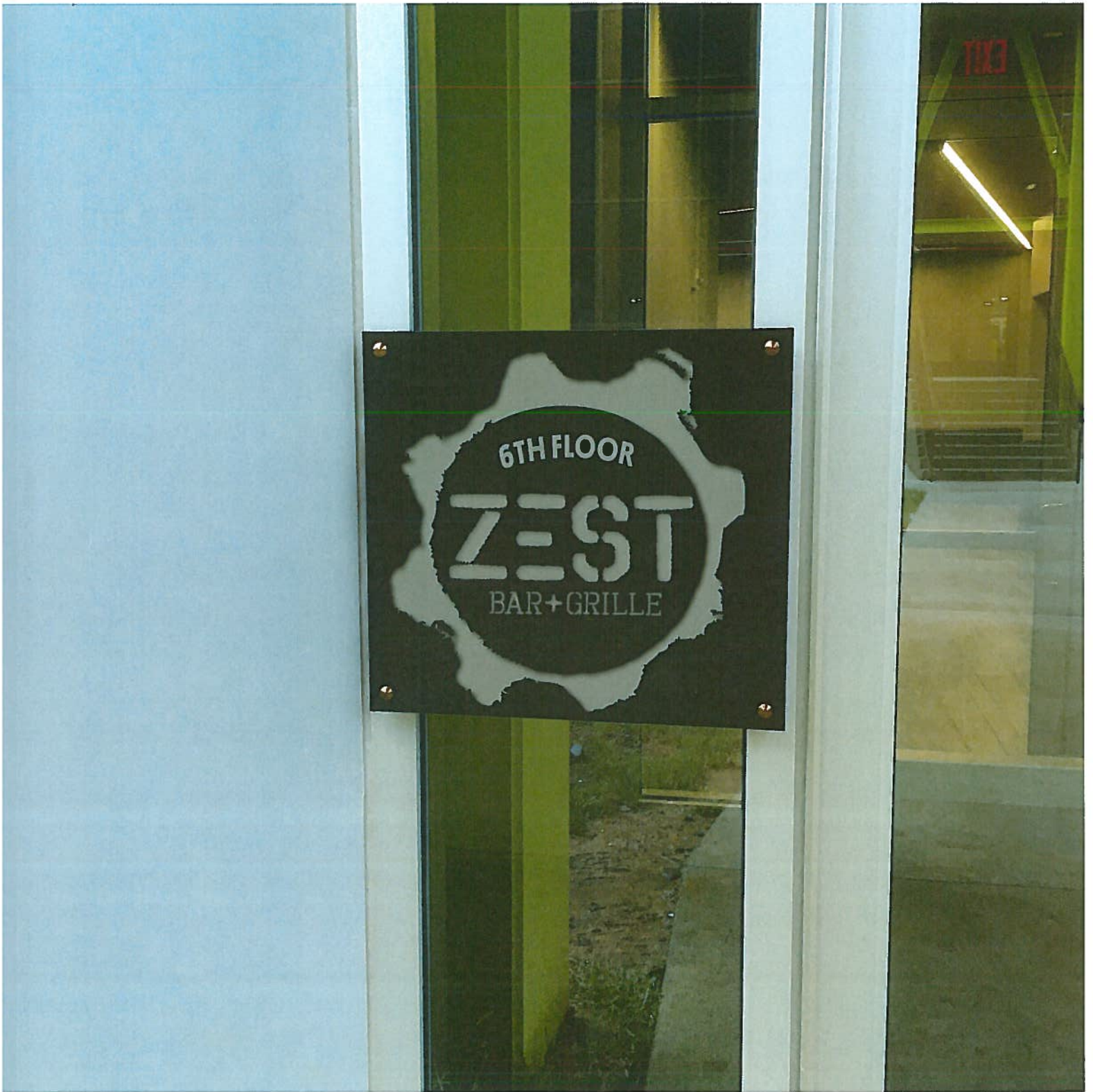
Proposed sign both locations